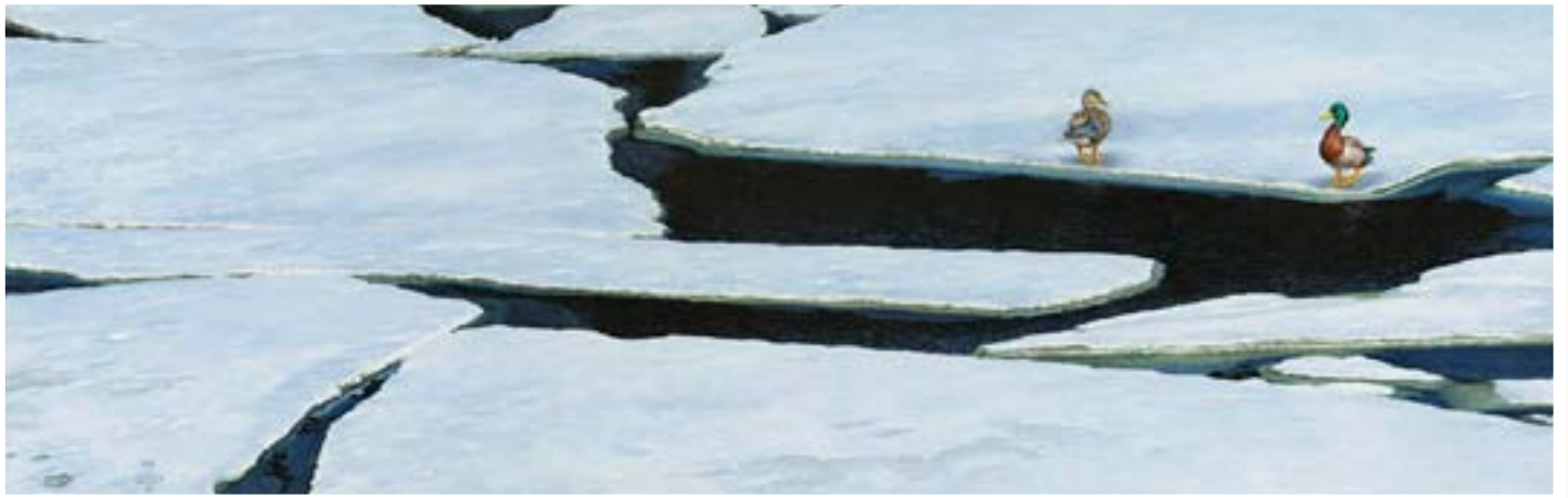
“The Break Up”