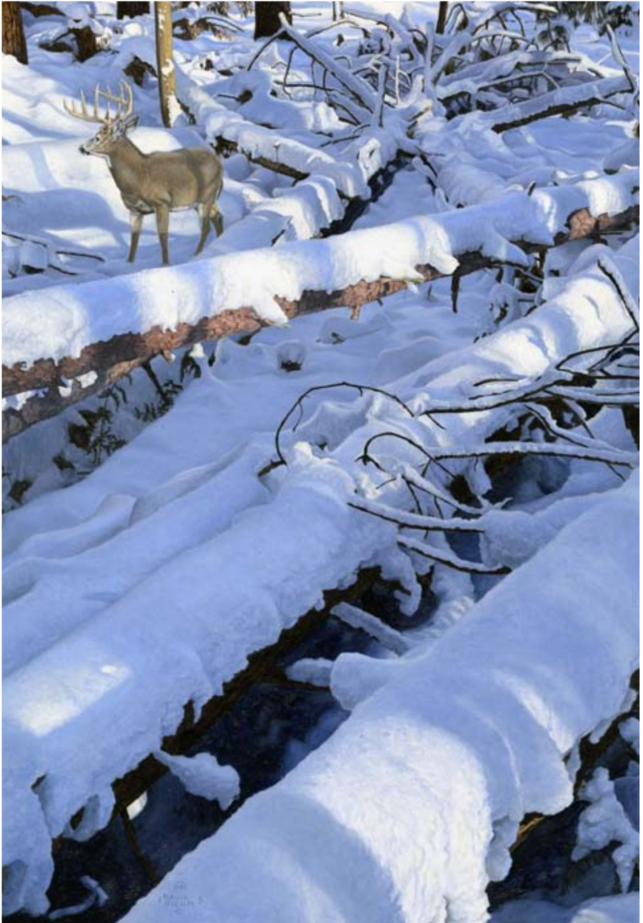
“Clearing the Blow Downs”