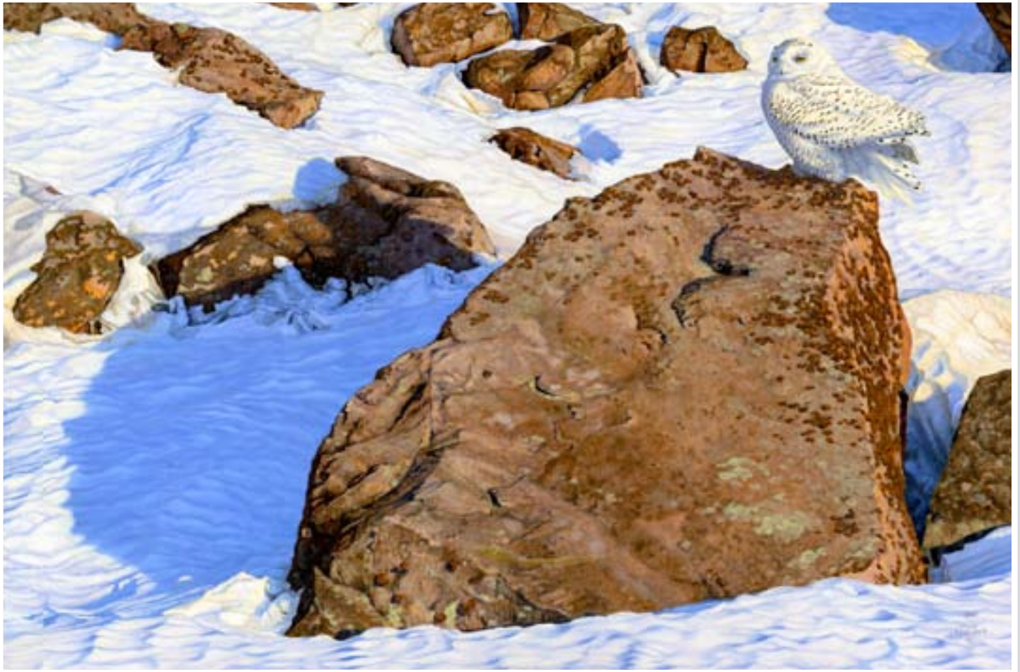
“Snowy Owl II”