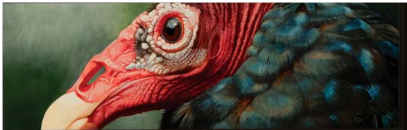
“Turkey Vulture Portrait”