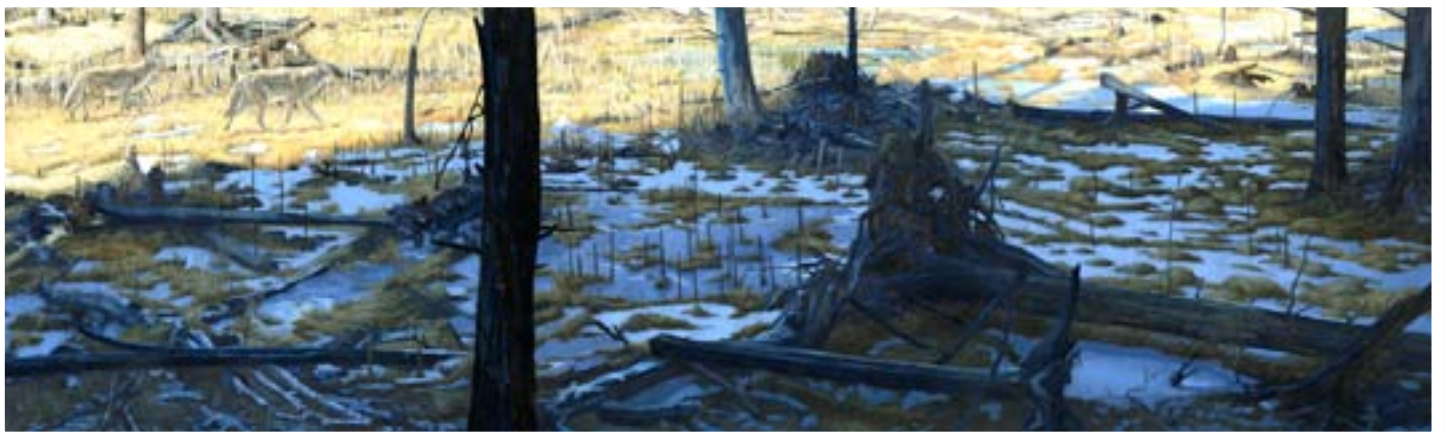
“Working the Edge”