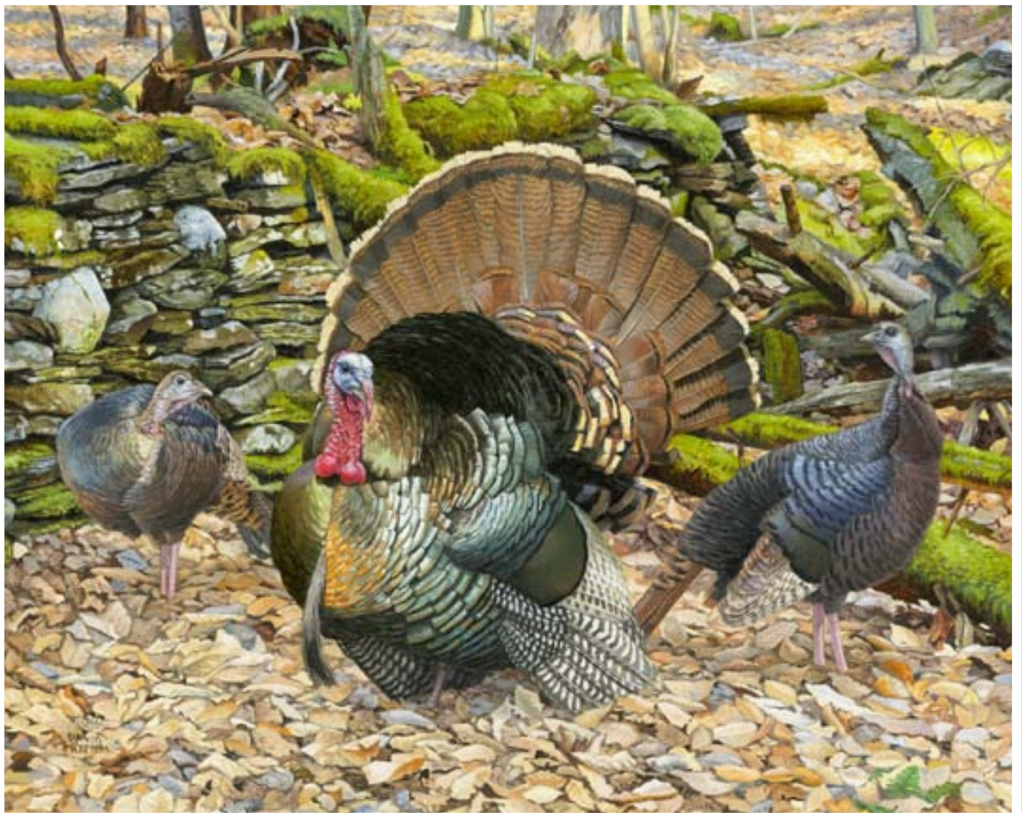
“Three’s a Crowd”